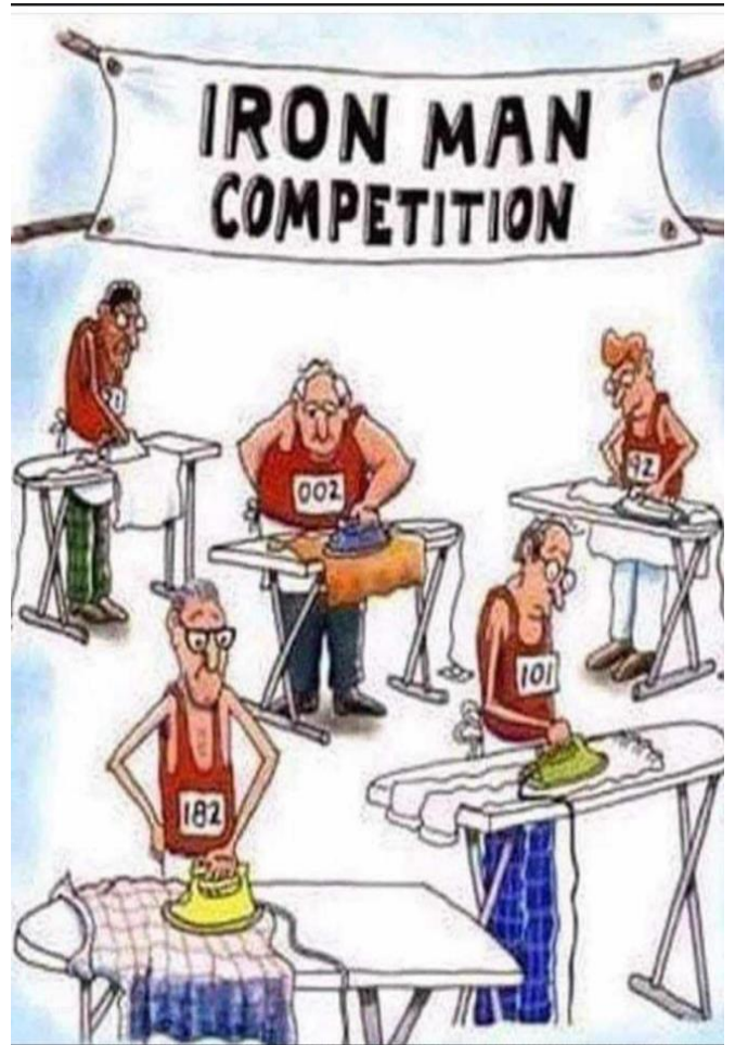
... Cartoon courtesy of Irene Rushworth